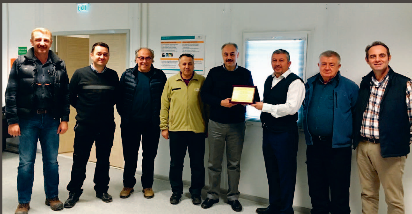
TANAP Compressor and Metering Stations Project team was presented a plaque of appreciation by the client for its achievement to complete 1 million man-hours without any accidents.

We congratulate each and everyone who has contributed to these remarkable achievements, and hope safe and healthy days will continue, taking this opportunity to make the reminder that no work is urgent or important enough to do unsafely.